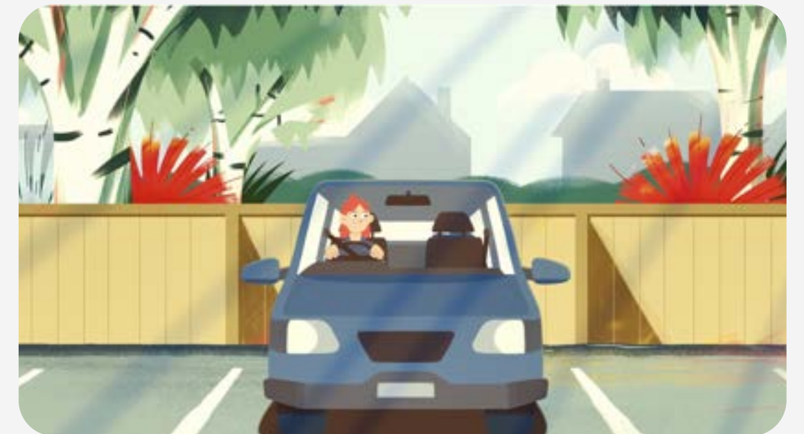
CHILDREN LEFT UNATTENDED IN CARS