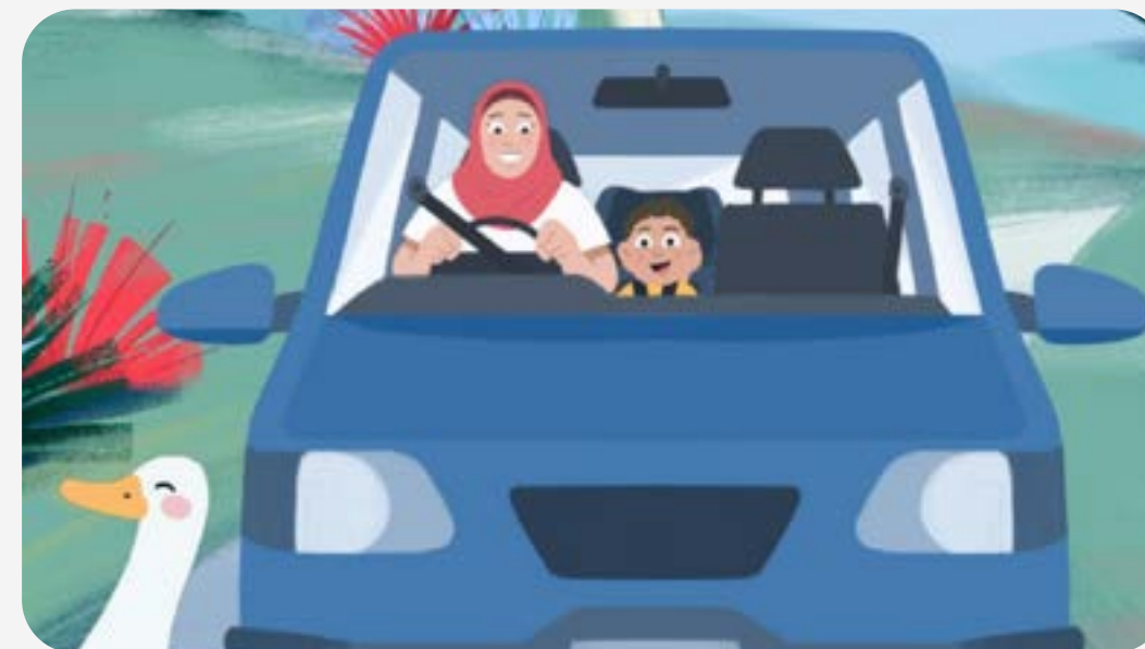
CHILD CAR RESTRAINTS