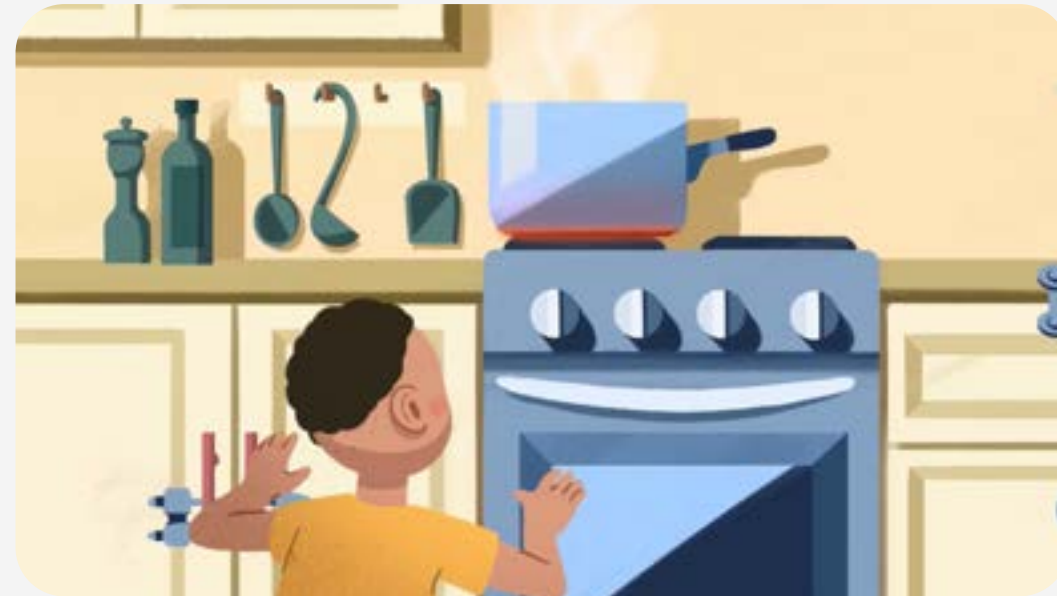
BURNS AND SCALDS

Please click on the image titles to download a copy