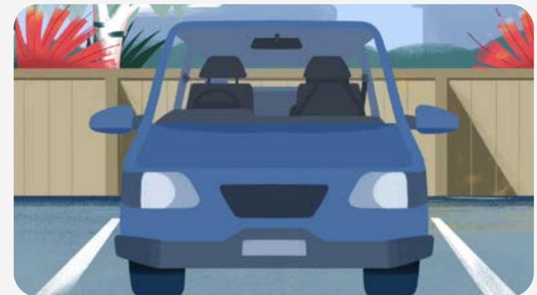
CHILDREN LEFT UNATTENDED IN CARS